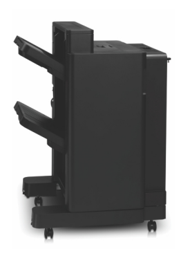
The two-bin, 3,000-sheet stapler/ stacker, just one of three optional finishing accessories that can save you time.