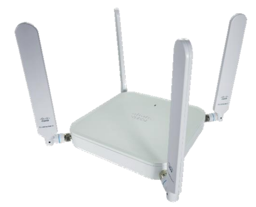
Figure 1. Cisco Catalyst Cellular Gateway

Cisco Catalyst Cellular Gateways connect your users and devices to trusted cloud and enterprise applications using 5G and 4G LTE Advanced Pro technologies. When combined with Cisco SD-WAN, they enable you to automate deployment, manage policies, and monitor network traffic over a cellular WAN with greater flexibility.